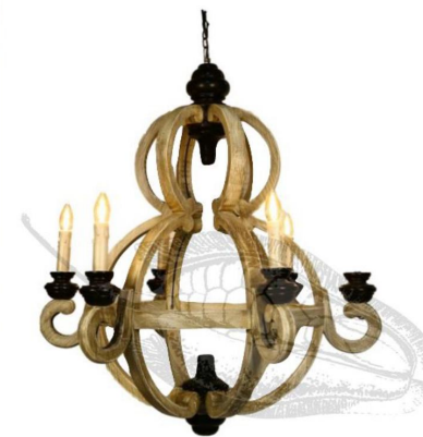
SERIAL NO.UEN-18-02-45 ITEM NAME-WOODEN CHANDELIER LARGE