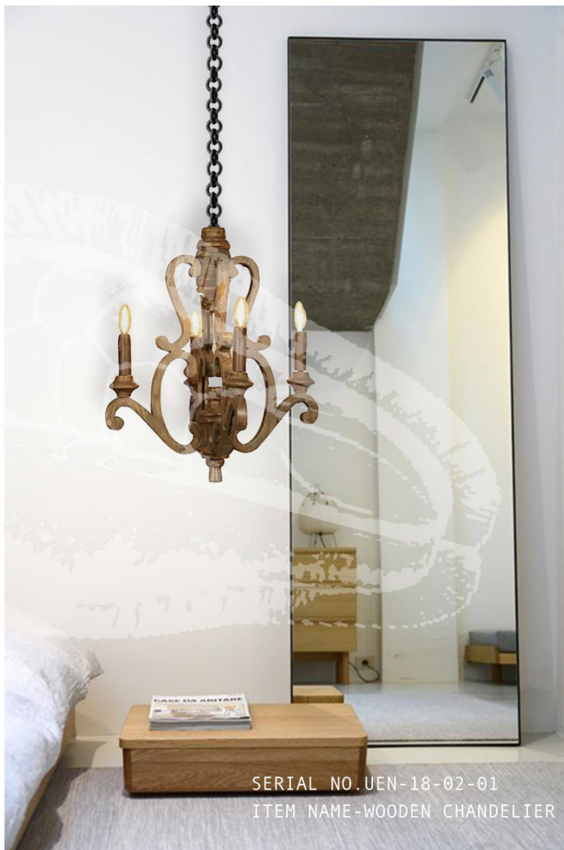
SERIAL NO.UEN-18-02-01 ITEM NAME-WOODEN CHANDELIER