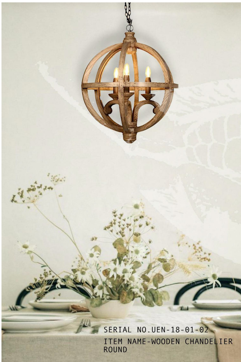
SERIAL NO.UEN-18-01-02 ITEM NAME-WOODEN CHANDELIER ROUND