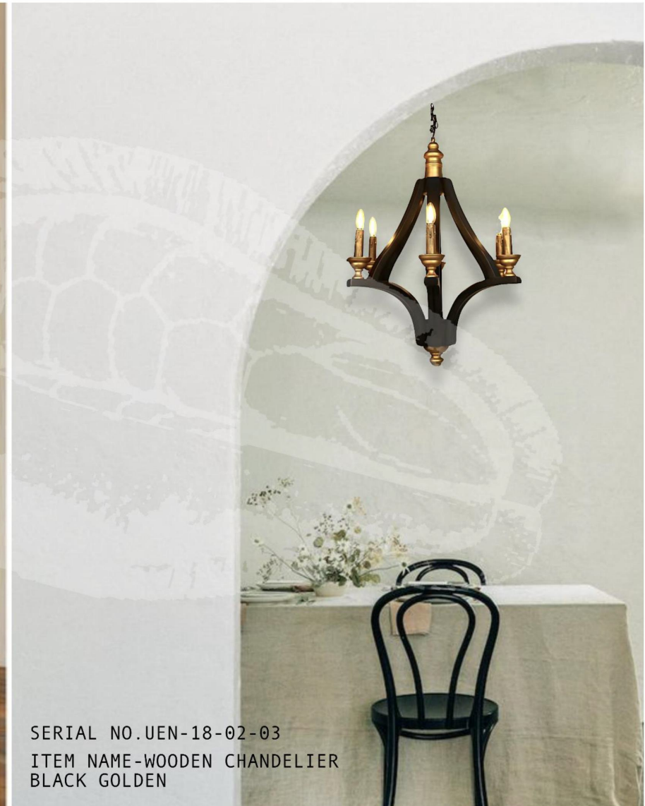
SERIAL NO.UEN-18-02-03 ITEM NAME-WOODEN CHANDELIER BLACK GOLDEN