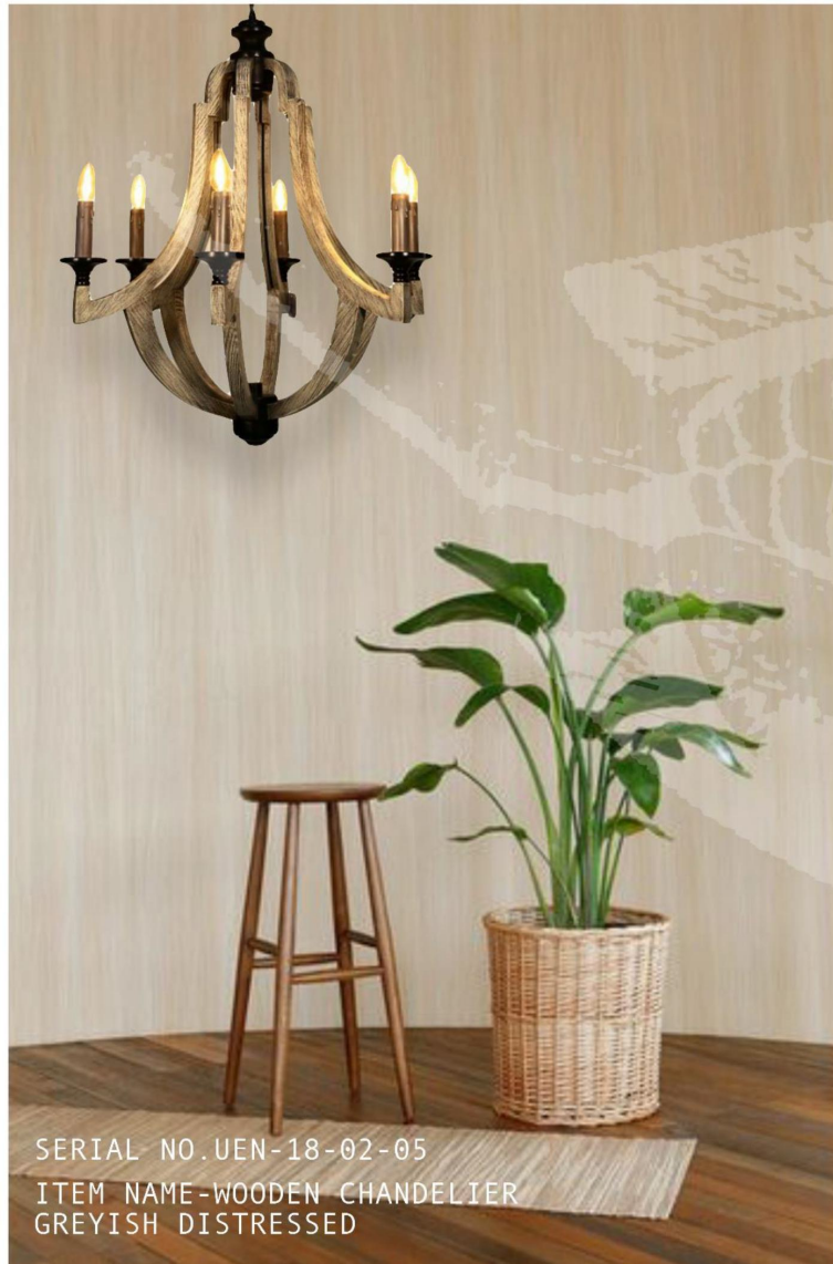
SERIAL NO.UEN-18-02-05 ITEM NAME-WOODEN CHANDELIER GREYISH DISTRESSED

Our handcrafted wooden chandeliers are made of pinewood, mango wood, and metal. The electrical fittings for these are as per the international standards(UL/CE) prevalent in the US, UK, and European markets. Explore our range of intricately designed pendant lights to light up your life.