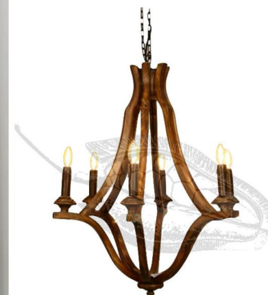
SERIAL NO.UEN-18-02-04 ITEM NAME-WOODEN CHANDELIER GOLDEN